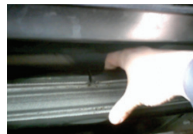
Photo 2 - Damage