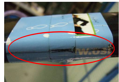
Photo 6 - Film contact / damage