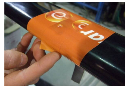
Photo 5 - No air bubbles / wrinkles