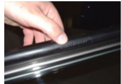
Photo 1 - Handrail Brand

Cracks and deep cuts could negatively affect an ADRail installation.