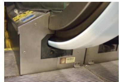
Photo 10 - Inlet Inspection