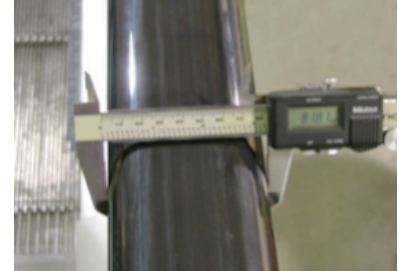
Photo 8 - Handrail Width

Sometimes interior designers have incorporated columns, safety features, or other items very close to the escalator. These obstructions can prevent the ability to install ADRail. If any obstructions are apparent, please note them. If unsure, please email a photo to adrail@ehc-global.com for clarification.