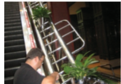
Photo 11 - Obstructions